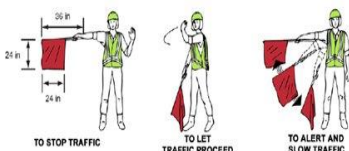
TO STOP TRAFFIC